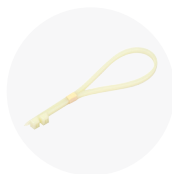
2x plastic straps