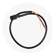
0.35 m 4pin Automotive adapter cable