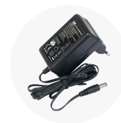
24V 0.8 A power adapter